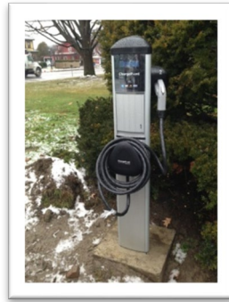
Montpelier, corner of State Street and Governor Aiken Avenue: Example of designated area after installation is complete