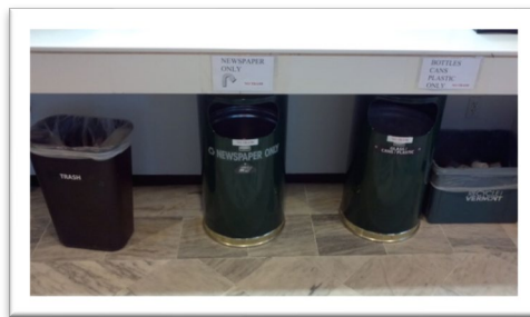
Montpelier Capitol Complex at State House Cafeteria Area