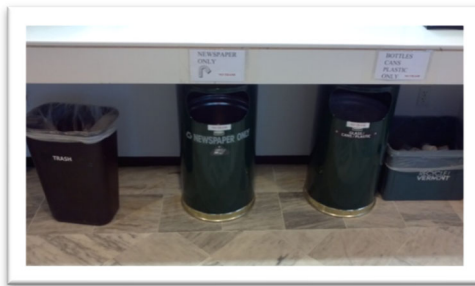
Montpelier Capitol Complex at State House Cafeteria Area