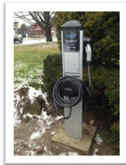
Montpelier, corner of State Street and Governor Aiken Avenue: Example of designated area after installation is complete